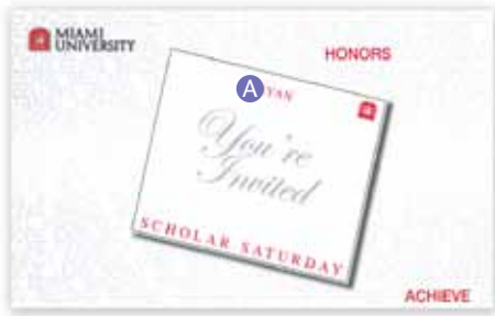
A Name personalization