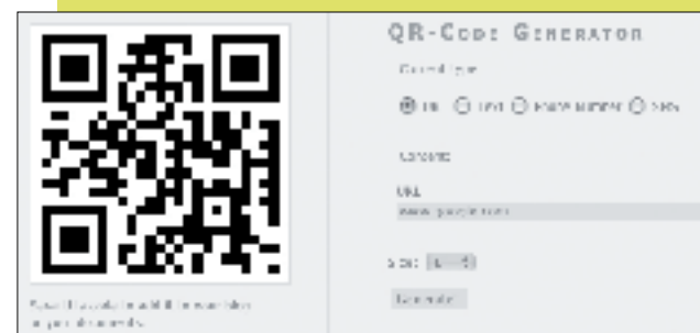
An example of a QR code generated for a link to Google on Kaywa QR-Code Generator.

To create the most basic codes, you simply go to the site, input the URL to which you would like the code to point, and hit "generate code." You'll get back a .png or .jpg image that you can save and insert into your print or online materials.